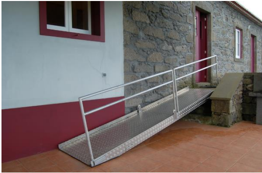
Access to the veranda: wheelchair ramp