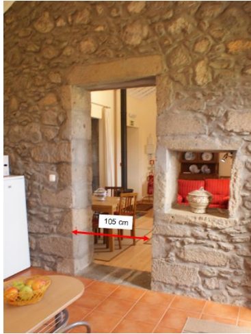
The kitchen /living access