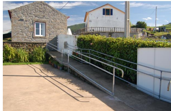
The private car parking with automatic car gate and the wheelchair ramp