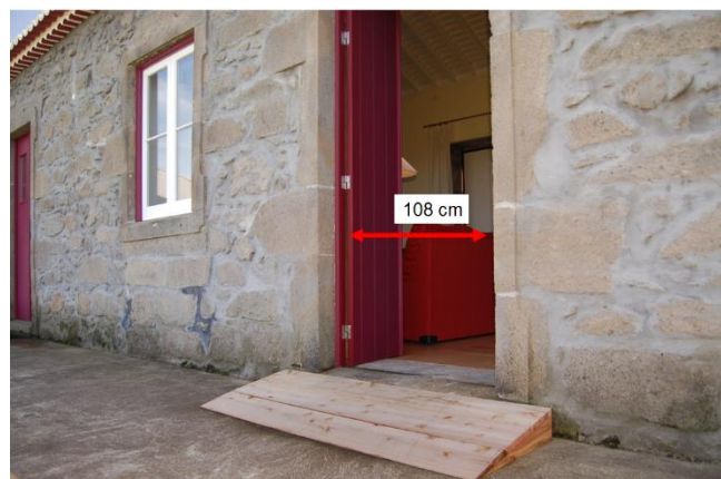
The main door