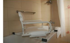
The bathroom equipment