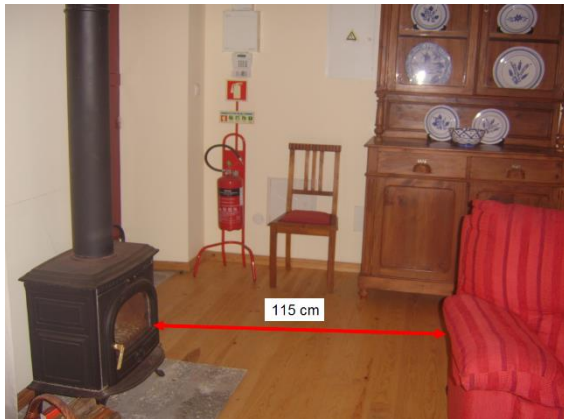
A living detail