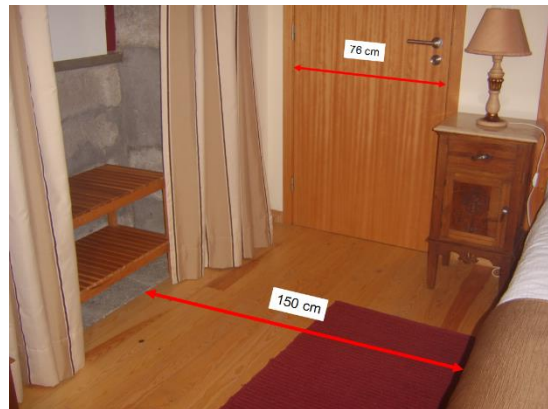
The bedroom details